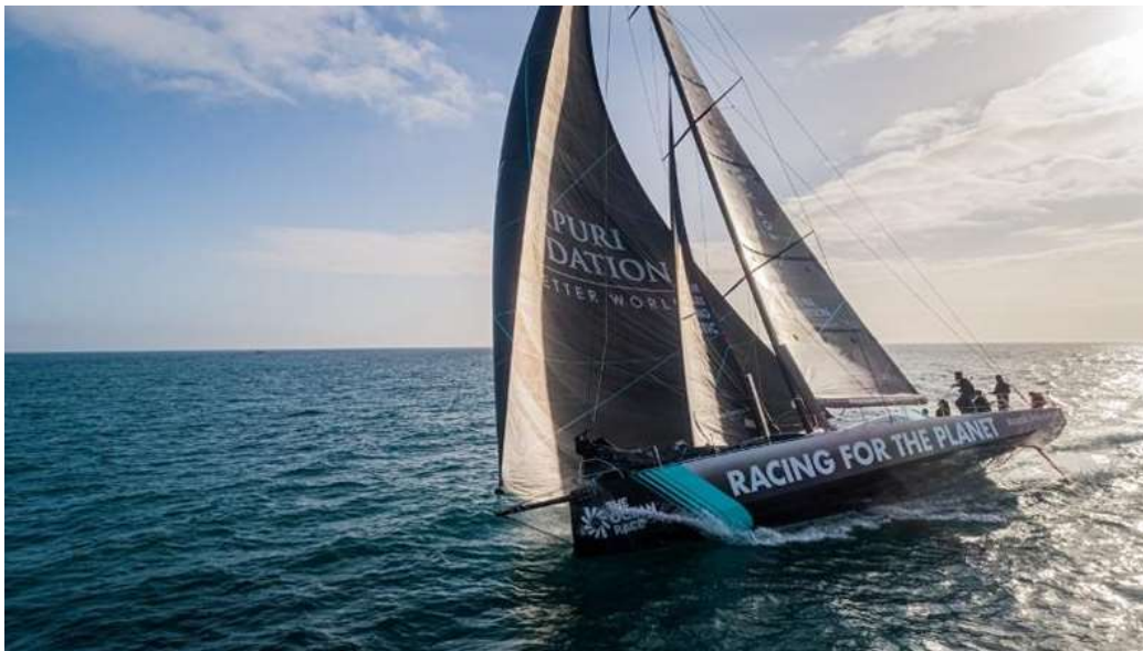
Mirpuri Foundation Racing Team

by Mirpuri Foundation Racing Team 4 Feb 12:44 UTC